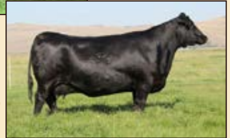
Right: Abigale 0277 Granddam of Coleman Resource 918