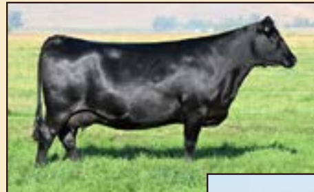
Left: Abigale 686 Dam of Coleman Resource 918

Stout made, thick bull with big testicles, out of a beautiful Motive daughter. His dam exemplifies what we love about the Motive cows, easy fleshing, deep bodied, and fertile. She has a calving interval of 6/368. ¾ brother to Lot 51.