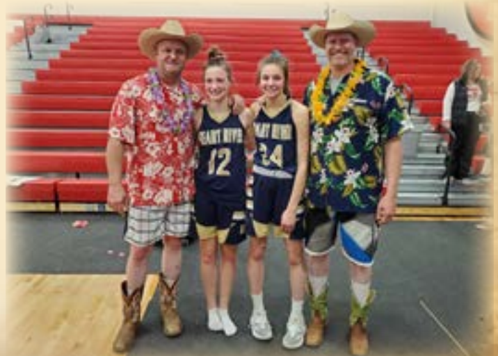
Region 7 Basketball Championship Game.

High volume bull that will work on cows or heifers. His dam is 4/99 for BW and his granddam was a Pathfinder that was 9/97 for BW and 9/104 for WW. 3/4 brother to lots 25 and 27.