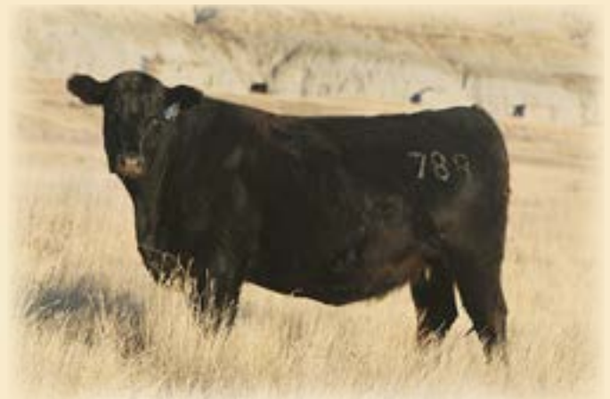
SAT Prairie 788 • Dam of Wolverine