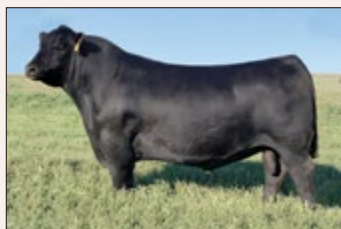
SAV Raindance 6343