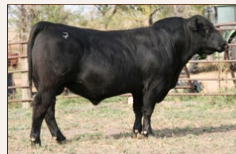
Best Fortunate 9144 • Reg# 19489760 BD: 4/17/19 • BW: 88 • WR: 112 • YR: 113 Fortunate 7027 X Alliance 64L X Right Time 8024