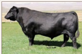
CCA Emblazon 702