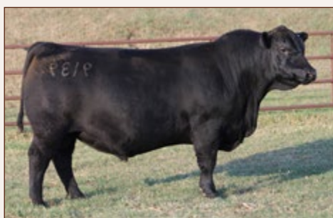
S R Raindance 9139 • Reg# 19634807 BD: 3/29/19 • BW: 85 • WR: 110 • YR: 115 Raindance X Resource X Game Day