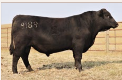
SAT Right Time 9188 • Reg# 19832675 BD: 3/25/19 • BW: 96 • WR: 104 • YR: 100 Right Time 547 X Payweight 1682 X Gumbo