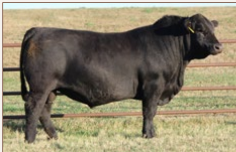
S R Torque 9129 • Reg# 19632295 BD: 3/24/19 • BW: 92 • WR: 110 • YR: 107 Torque X OCC Paxton X Traveler 10619

These coming-2-year-old ANGUS bulls are thick, stout, rugged, fully guaranteed and are ready for service in big country and were retained specifically for this sale. We are excited to offer these bulls as it gives us a chance to see our genetics as they age and develop. These bulls have been slowly developed with soundness and longevity in mind with an optimum gain not an excessive gain. Our ultimate goal is to have the bulls range-ready, sound-footed and ready to go to work for you! Catalogs mailed on request only.