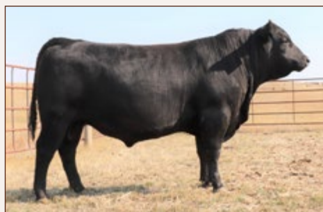
SAT Versatile 9157 • Reg# 19544353 BD: 3/17/29 • BW: 74 • WR: 94 • YR: 88 Versatile X Game Day X Freightliner 705T