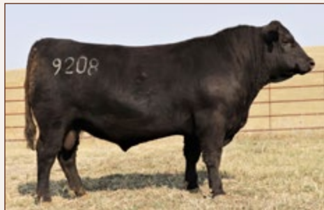
SAT Right Time 9208 • Reg# 19832677 BD: 3/31/19 • BW: 74 • WR: 98 • YR: 101 Right Time 547 X Nationwide X Right Time