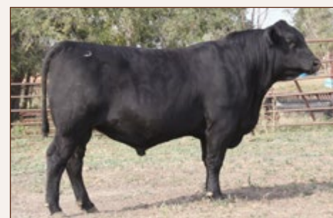
Best Rainmaker 9148 • Reg# 19489763 BD: 4/17/19 • BW: 94 • WR: 99 • YR: 102 Rainmaker 7042 X Diego 1017 X Duke 104