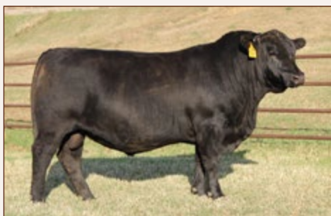
S R Emblazon 937 • Reg# 19632911 BD: 3/6/19 • BW: 61 • WR: 102 • YR: 106 Emblazon 702 X Thunder X Resource