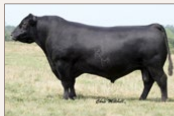
Angus Alliance Winchester