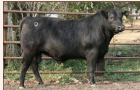
Best Rainmaker 9315 • Reg# 19823857 BD: 3/20/19 • BW: 70 • WR: 100 • YR: 100 Rainmaker 7042 X Tracker 5038 X Missing Link 2026