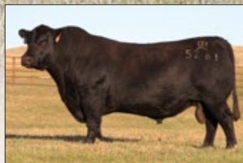
Bruin Torque 5261

Contact us today to be added to the mailing list!